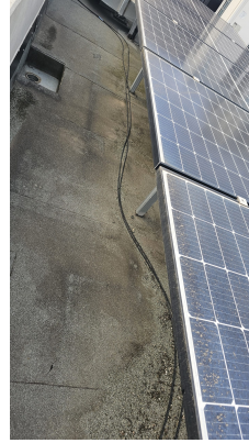
19 Howard St Richmond - Rooftop Cabling Image 2