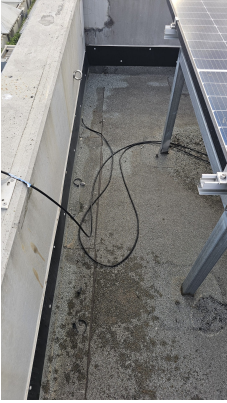
19 Howard St Richmond - Rooftop Cabling Image 1