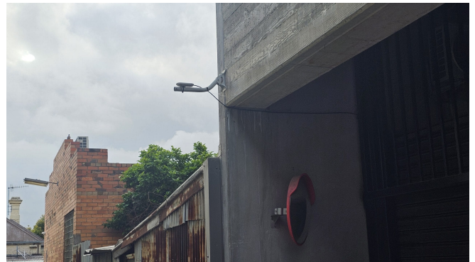
Ubiquiti WiFi Receiver on Ground Floor - No Longer in Use