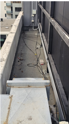
19 Howard St Richmond - Rooftop Cabling Image 3