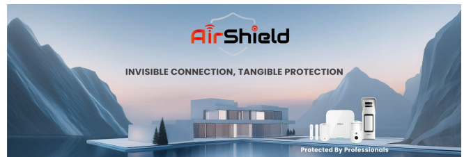
Dahua AirShield Wireless Alarm System