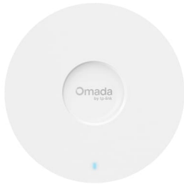
TP-Link Omada EAP610 WiFi 6 Access Point