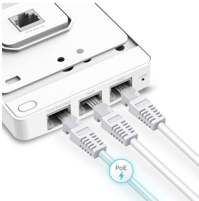
TP-Link EAP615-Wall Installation