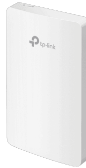
TP-Link EAP615-Wall WiFi 6 Access Point